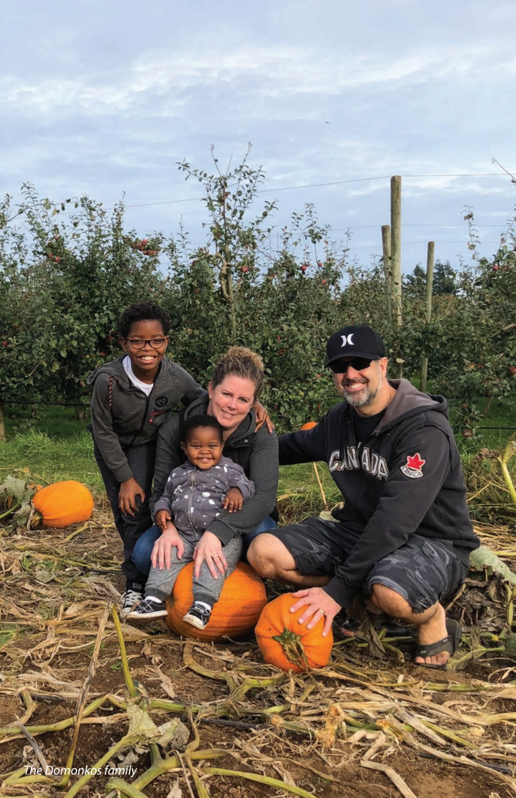
The Domonkos family