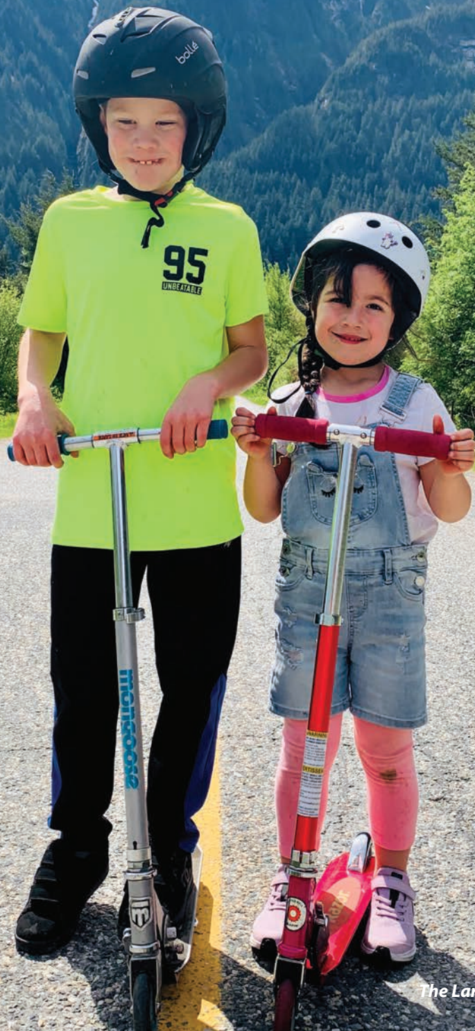
The Larocque family