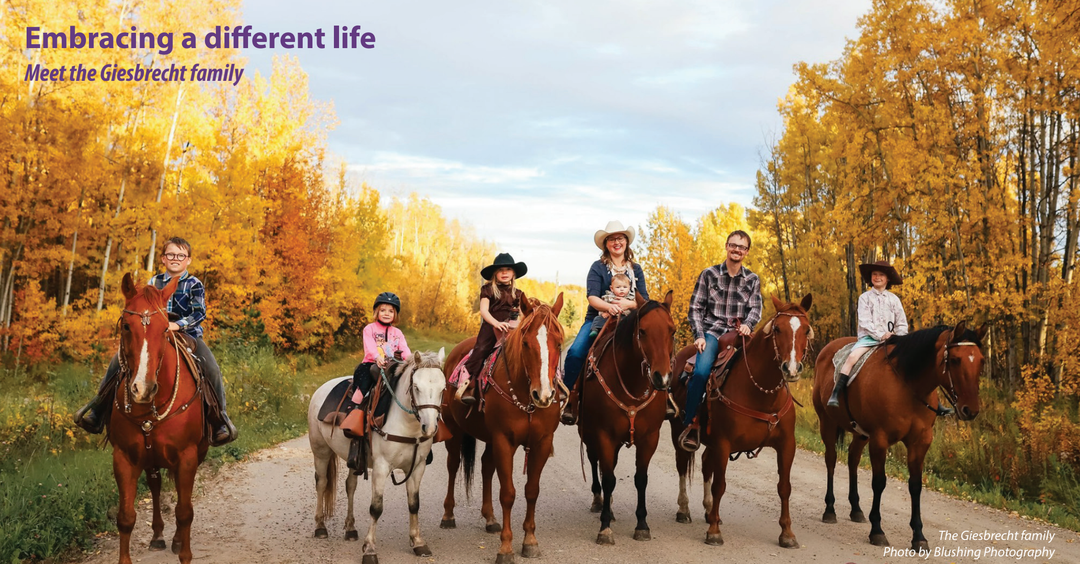
The Giesbrecht family