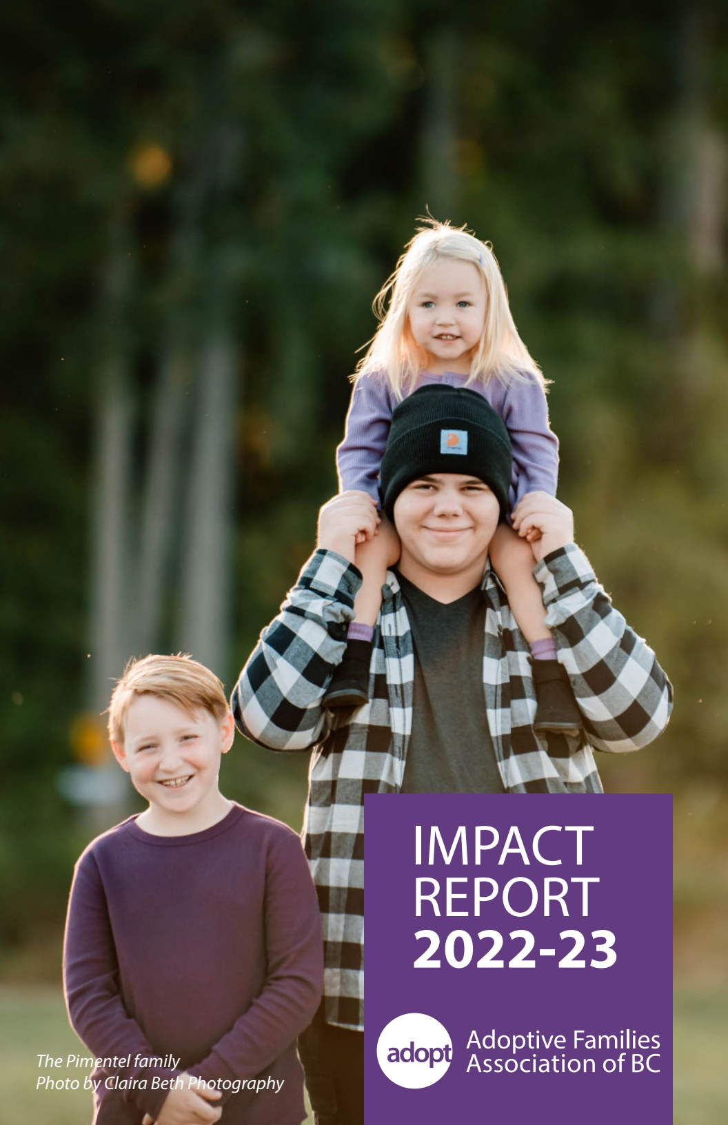
The Pimentel family